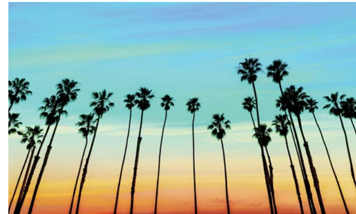
Los Angeles, California